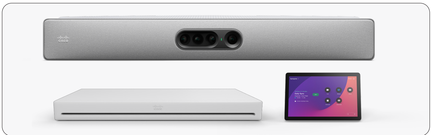
Figure 2. Main components of the Cisco Room EQ bundle: Cisco Codec EQ, Cisco Quad Camera, and the Cisco Room Navigator touch controller