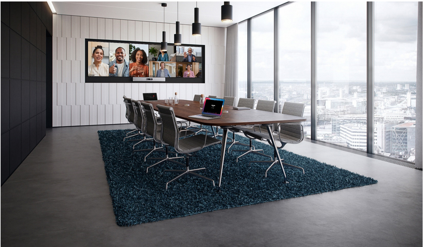
Figure 1. The Cisco Room Kit EQ in a conference room with the Quad Camera, the table-stand Room Navigator, and the Cisco Table Microphone Pro.

The Room Kit EQ provides optionality and extensibility with a highly modular setup to easily add touch controllers, cameras, speakers, microphones, and other room peripherals – easing the configuration and scaling of complex, multi-component audiovisual environments. This solution is rich in functionality and experience yet easy to deploy, maintain, and scale to your workspaces – and comes with unified cloud device management and workspace analytics in Control Hub.