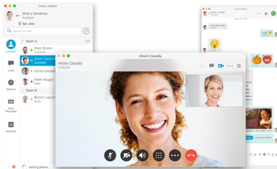
Figure 1. Cisco Jabber for Mac

The Cisco Jabber platform streamlines communications and enhances productivity by unifying presence, instant messaging, video, voice, voice messaging, screen sharing, and conferencing capabilities securely into one client on your desktop. Cisco Jabber for Mac delivers highly secure, clear, and reliable communications. It offers flexible deployment models, the platform is built on open standards, and it integrates with commonly used desktop applications. With the Cisco Jabber application, you can communicate and collaborate effectively from anywhere you have an Internet connection (Figure 1).