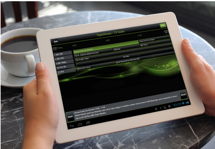
ACCESS HIGH QUALITY EPG THROUGH THE TRIPLESTREAM APP FROM ANY INTERNET ENABLED DEVICE WITH WIFI, 3G OR 4G NETWORK