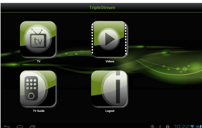
TV, VIDEO AND EPG VIA THE TRIPLESTREAM APP

ACCESS FROM ALL MAJOR INTERNET ENABLED MOBILE DEVICES