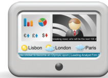
HD DIGITAL SIGNAGE