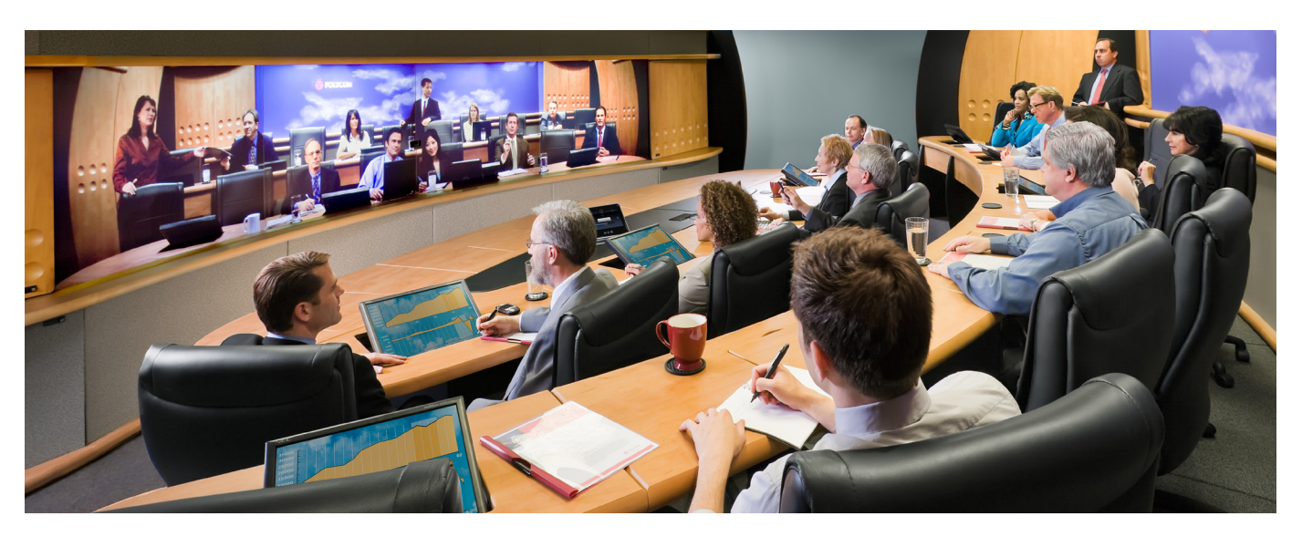
Connect teams across the country or around the world for highly effective and effortless meeting experiences with unprecedented visual communication using the Polycom RealPresence Experience.

Empower teams to meet face-to-face with key customers on a regular basis to foster closer, more productive relationships. With greater customer interaction, you can improve customer satisfaction, accelerate decision making, and improve sales cycles.