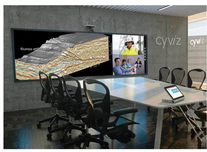
Cyviz screens and projection technology have been designed for professionals who require high levels of photorealism.