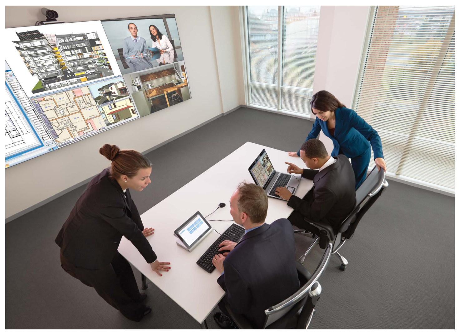
Multiple images, multiple sources—our systems boast unsurpassed flexibility.