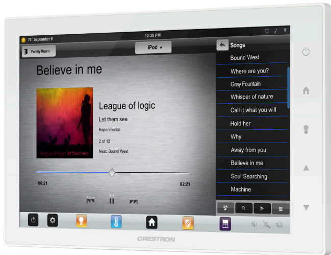
TSW-1050-W-S – Shown in White