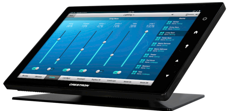
TSW-1050-B-S with TSW-1050-TTK TableTop Mounting Kit

Using PoE technology, the TSW-1050 gets its operating power right through the LAN wiring. PoE (Power over Ethernet) eliminates the need for a local power supply or any dedicated power wiring. A PoE Injector ( PWE-4803RU [2] ) simply connects in line with the LAN cable at a convenient location. Crestron PoE switches ( CEN-SW-POE-5 , CEN-SWPOE-16 , or CEN-SWPOE-24 [2] ) may also be used to provide a total networking solution with built-in PoE.